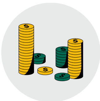
Currency EURO (EUR)

Make growing your team simple with Emerald as a global partner.