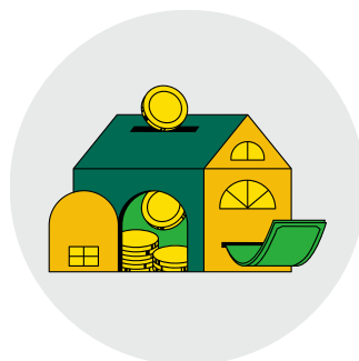
Employer Costs Estimated 27% of employee's salary