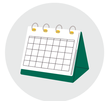
Payroll Cycle Monthly