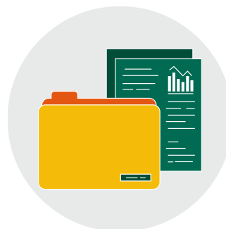
Onboarding 72 hours with Emerald Technology